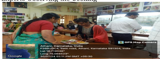
Experts Observing the Cooking