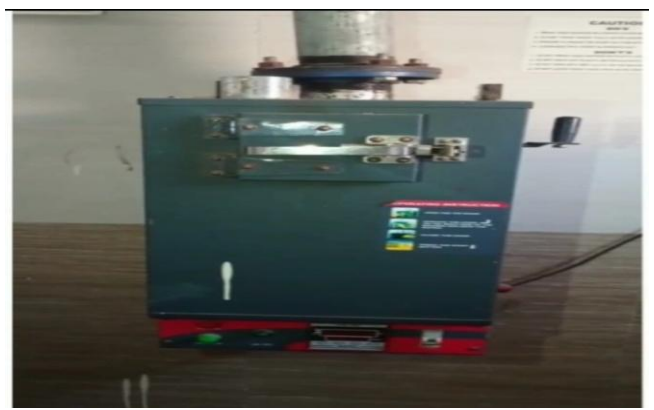
Sanitary Napkin Incinerator