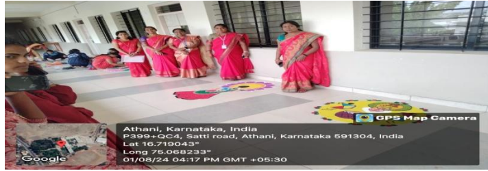
Experts Observing the Rangoli