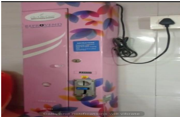
Sanitary Pad Machine